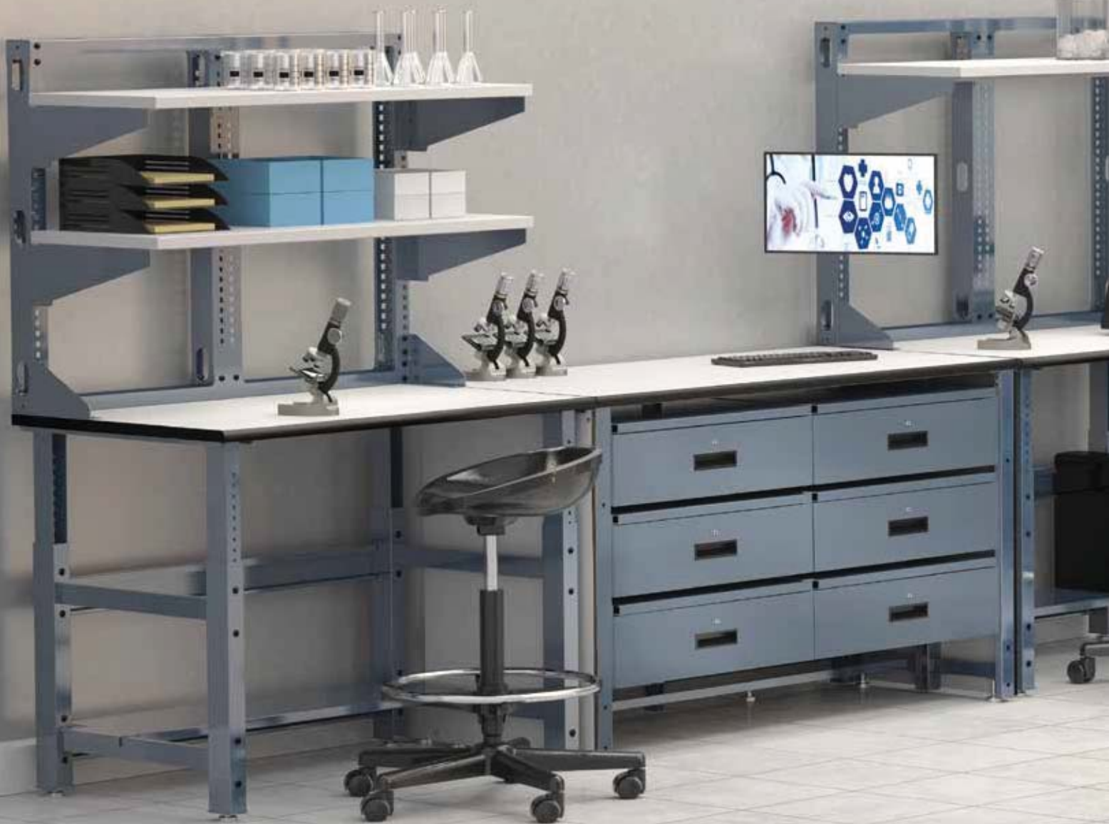
TechWorks benching system in Blue Medium painted frames with Designer White HPL laminate worksurface with Black edge, and with organizer frames and shelves. Storage Center (in middle) has six locking drawers and matching laminate top. 6005AG Tech Stools.