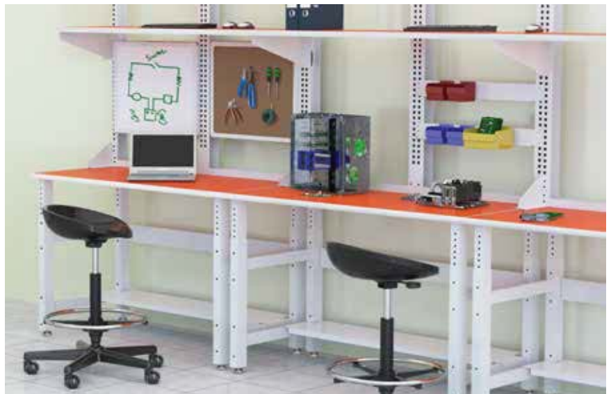
TechWorks® Benching Systems. Shown with Tangerine laminate/White edging surfaces, and White painted base/frames. Accessories include whiteboard, peg board, shelving and part bin panels; and 6005AG Tech Stools.