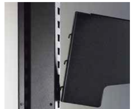
Storage options install and reconfigure in 1" increments above worksurfaces.