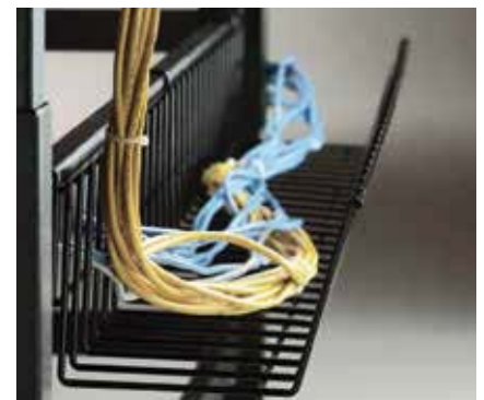
Optional baskets keep cables off the floor to maximize safety and reduce clutter.