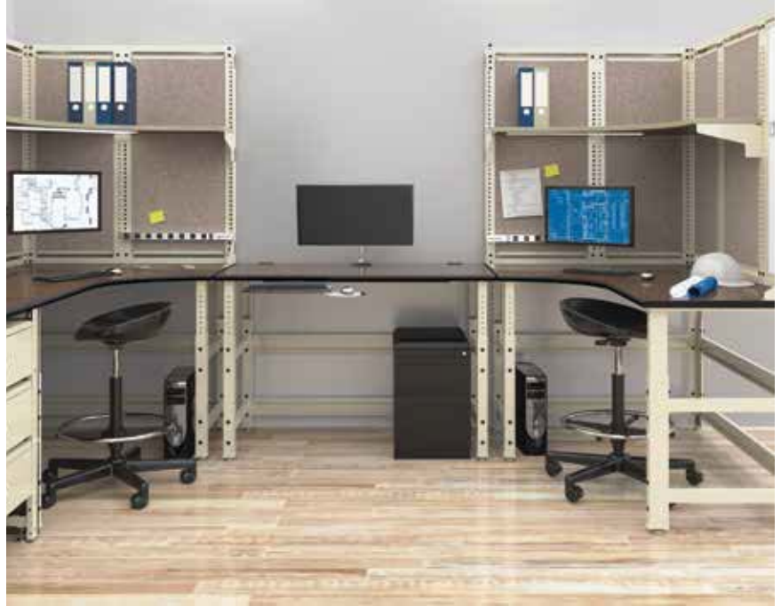
TechWorks® Corner Units. Includes corner organizer frames in Warm White paint with shelves and fabric tack panels. Corner worksurfaces are in Mahogany HPL laminate with black edge. Rectangle bench (in center) has keyboard tray and Mobile Box/File pedestal in Black. 6005AG Tech Stools.