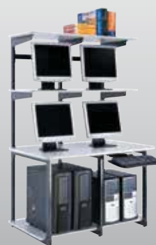
21148 48" LAN Station with optional keyboard support