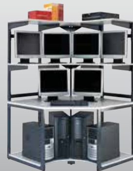
211CNR 48" Corner Station