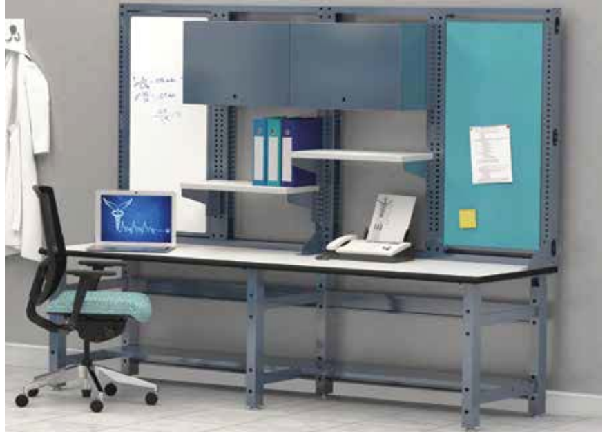
Work Station. Includes organizer frames, overhead storage cabinets, shelves, whiteboard and tack panel. Shown with Designer White HPL laminate with Black edge and Blue Medium painted frame. Gist™ chair in Syntax Turquoise fabric.