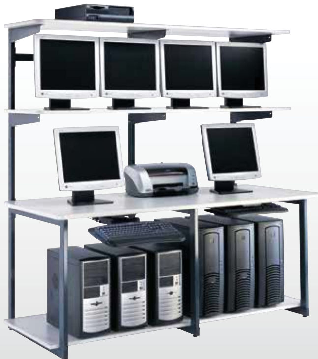
Model 21172 72" LAN Station with optional keyboard supports