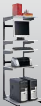
21145 24" Server Station

Five standard configurations make planning easy – select from a 72", 48" or 24" LAN Station, a generous 48" Corner Station, or a 24" Server Station to be used alone or in combination. Worksurfaces and shelves feature thermally-fused laminate in Ice Gray (only) and are complemented by frames in Graphite paint. Frames tested to 1,000 lbs. per 24" frame.