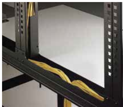
Organizer Frames offer both horizontally and vertically integrated cable management.