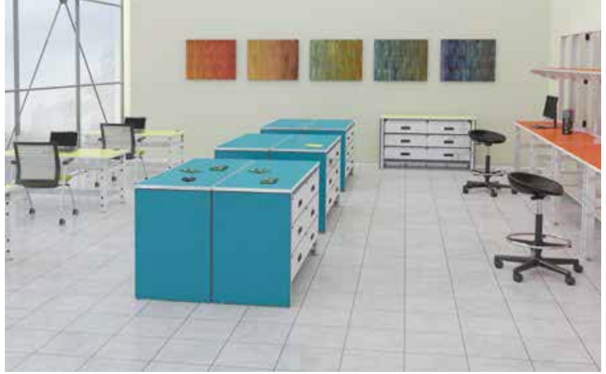
TechWorks® Training Room. Combine Desking with TechWorks Storage Centers (in Blue Agave laminate) and Benching in Tangerine laminate and White painted base/frames; 6005AG Tech Stools, and Thesis™ chairs.