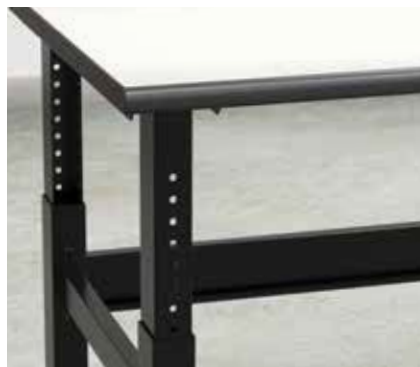
Benches can be installed from seated (26") up to standing (38") height, and support up to 1,000 lbs.