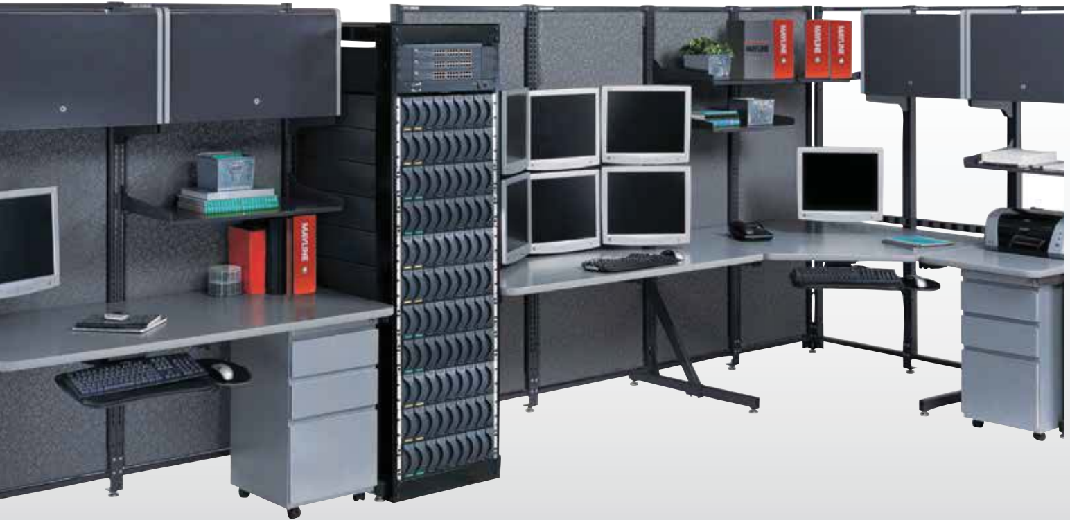
Maytrix system with Snapshot Starlight fabric by Guilford of Maine®, Fog Gray TFL laminate, frames in Blue Medium paint and mobile pedestals in Pebble Gray paint.