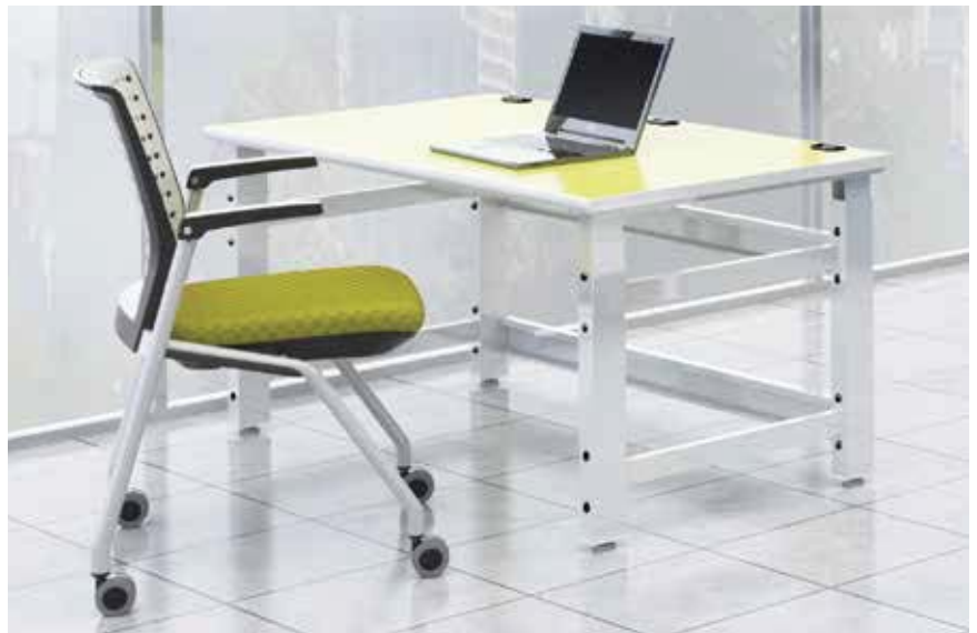
TechWorks® Desking. A single station shown in Thermally Fused laminate top in Kiwi with white painted base and Thesis™ chair in Insight Wasabi fabric.