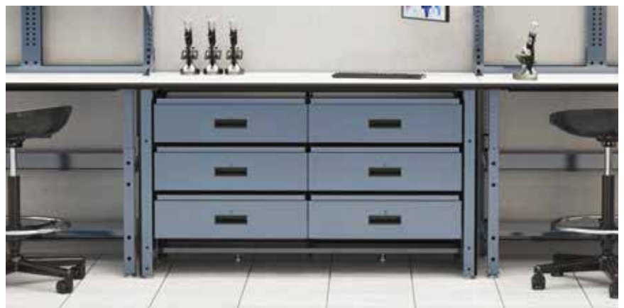
TechWorks® Storage Center (as shown) with Designer White HPL laminate and Blue Medium paint, with six locking drawers.