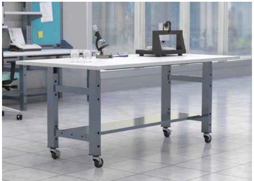
Mobile TechWorks® Table. Supports up to 1,000 lbs. and mobile on (4) 3" casters (2 locking). Shown with Designer White HPL laminate and Blue Medium painted base.