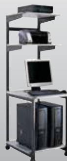
21124 24" LAN Station with optional casters